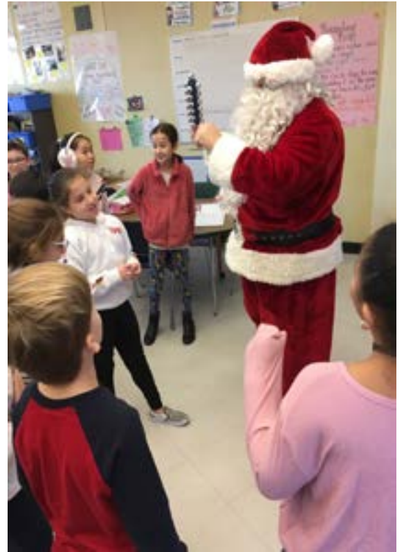
Santa visited School No. 3 third grade class with gifts from the PTA.