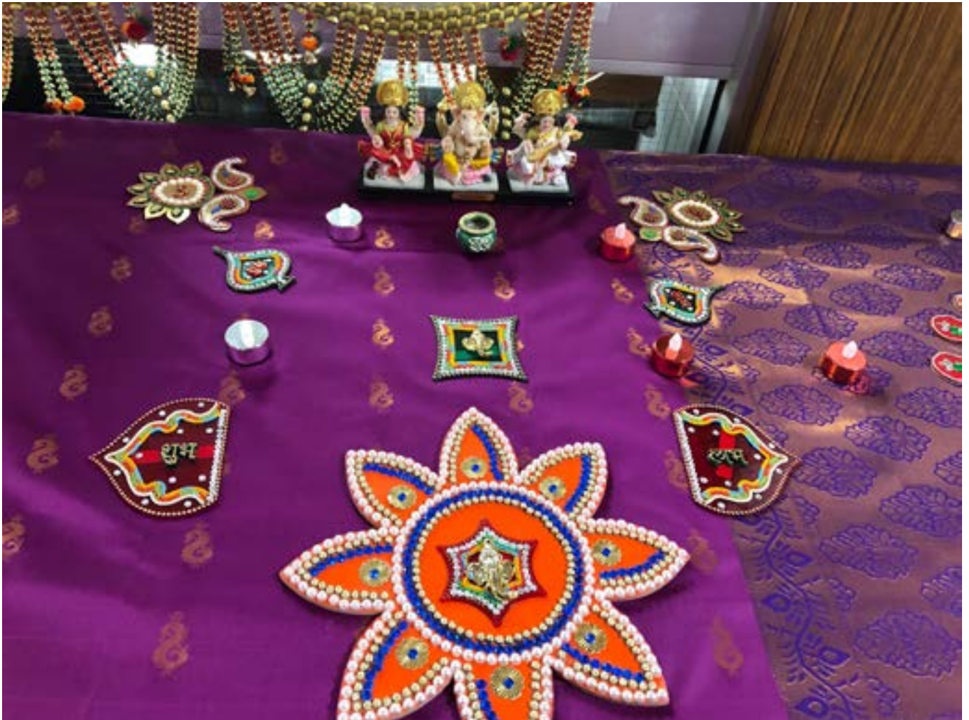
School No. 3 celebrated Diwali with our Indian community who created displays in the building.