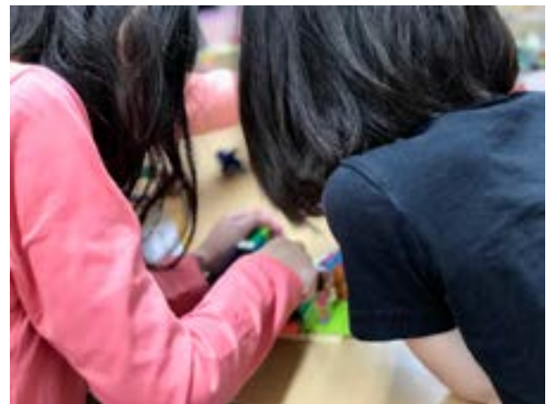
Students working in the School No. 3 library/media center on a Maker Space project, as part of our new library technology program.