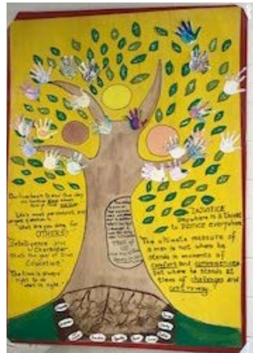
“Tree of Us”