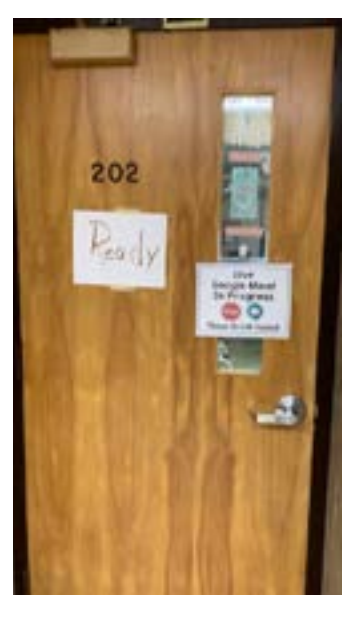
"Shhh...Live Google Meet in progress!"