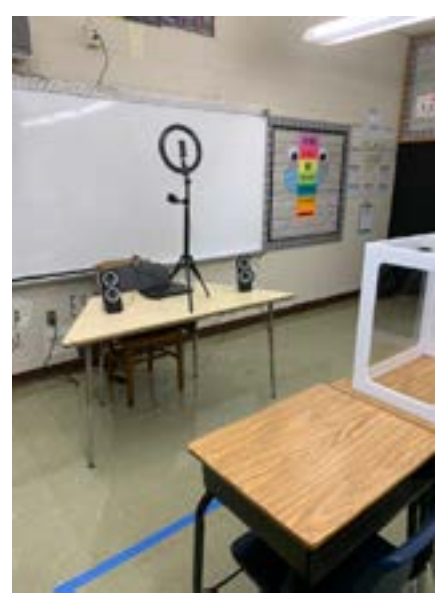
Projection equipment assists with virtual learning.