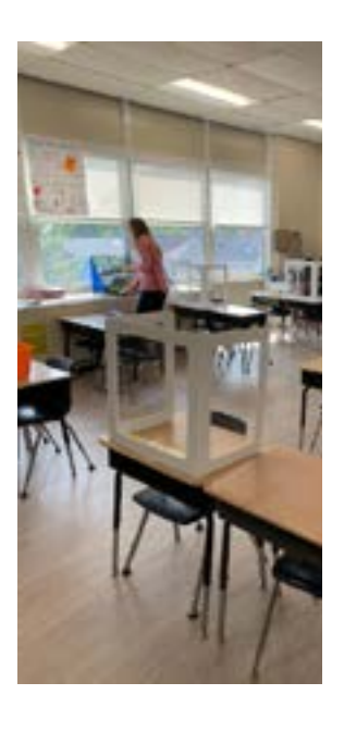
Classroom preparation to ensure social distancing.