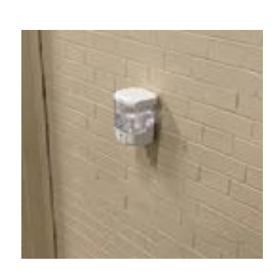
Hand sanitizing stations were installed throughout the school buildings.