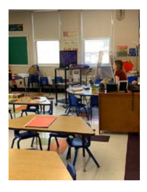
Plexiglass shields were installed on teacher's desks.