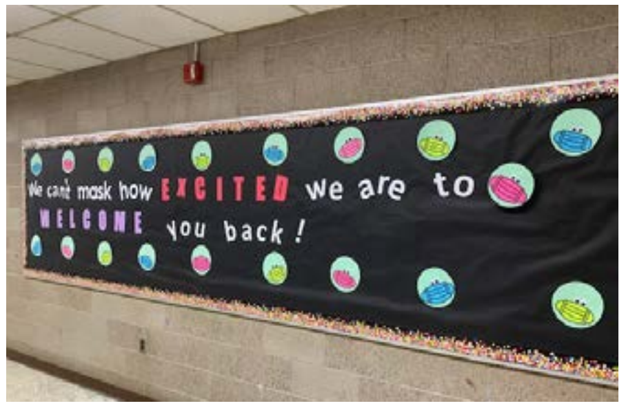
Masks were decorated with the students names to let them know "We can't mask how excited we are to welcome you back!"